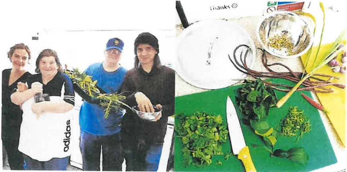
Delicious cooking in the depot with the Single Homeless Project using greenhouse produce

Park depot: A range of groups (e.g. trafficked women, Muslim Women healthy eating group, Single Homeless Project, ME Art group and CoolTan Arts) have used the park depot for regular meetings and cooking sessions. Lambeth Tigers FC continues to provide football training for up to 200 young people a week, using the depot as a storage space and Streetscape is based at the depot, providing horticultural apprenticeships for 12 young people.