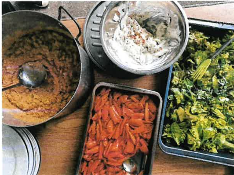
Delicious food cooked during the summer kitchen by wonderful volunteer Saskia