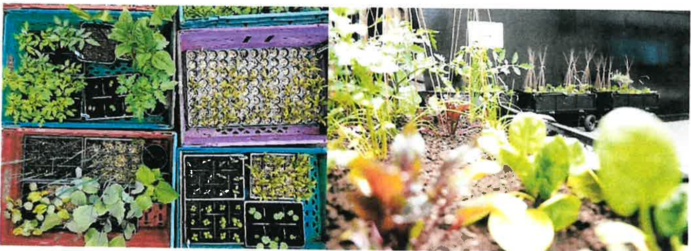
A selection of seedlings grown by community gardener Fabrice and the seedlings planted up by St Gabriel's college in their mobile veg garden