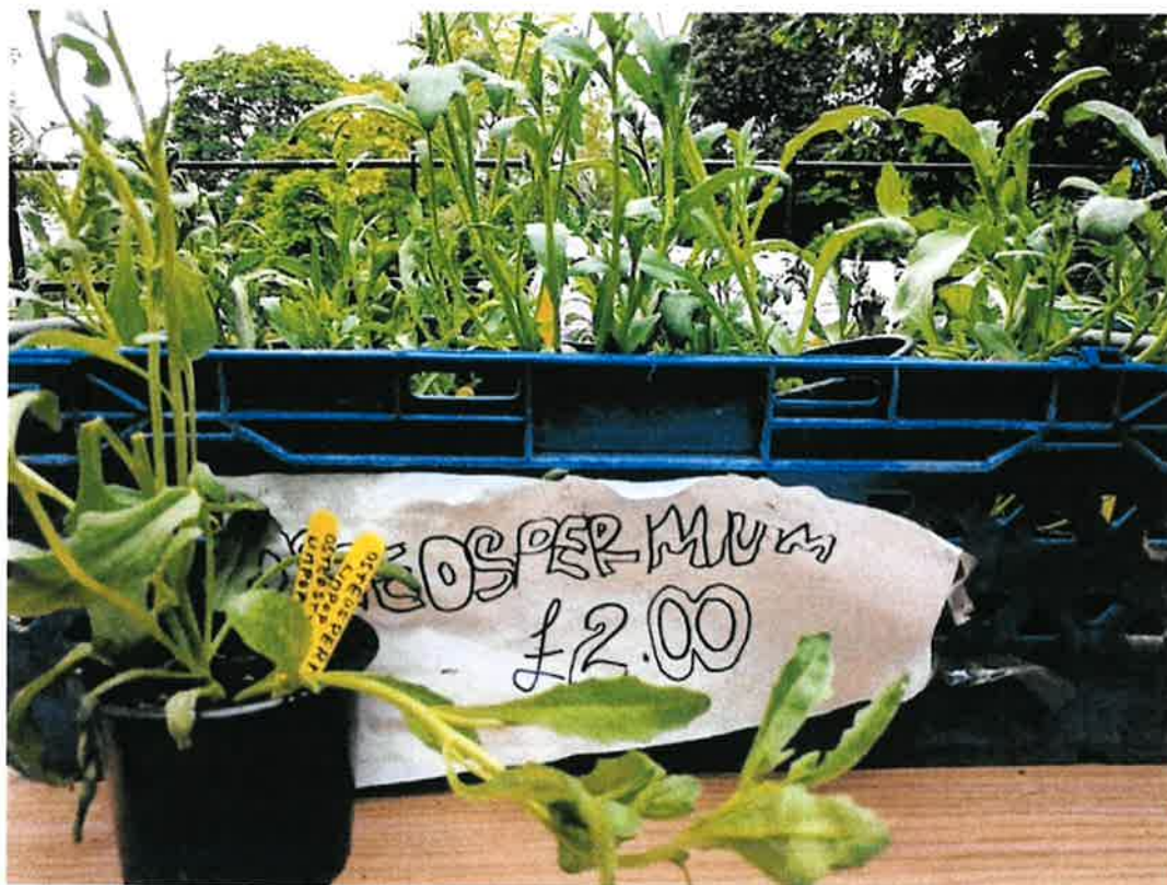
Osteospermum grown in the Greenhouse on sale at the Café

Small scale income: Smaller funding areas have been explored, e.g. selling vegetables grown in the Park at the café, generated approx. £50, hosting small stall holders on Sundays at £10 per stall on an ad hoc basis, hiring out our small Victorian glasshouse for parties @ £15 per hour